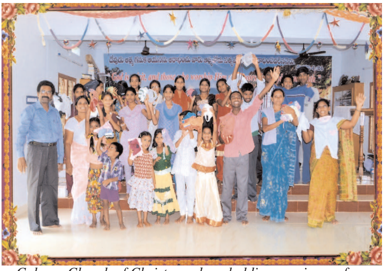
Calvary Church of Christ members holding up pieces of clothing received