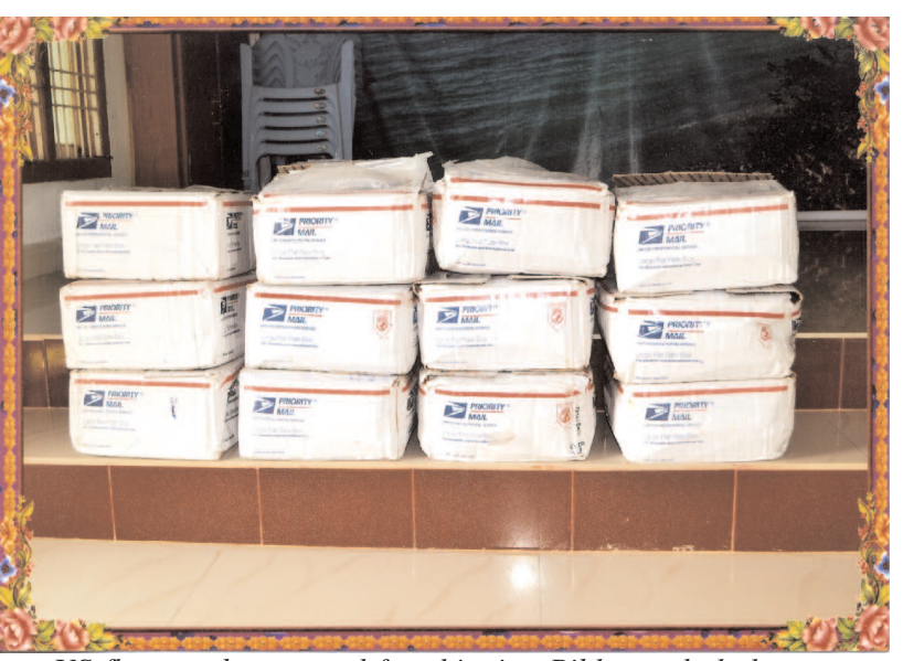
US flat rate boxes used for shipping Bibles and clothes - cost $77.95 ea